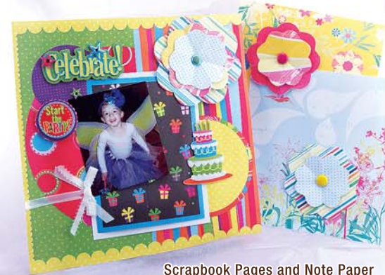
Scrapbook Pages and Note Paper