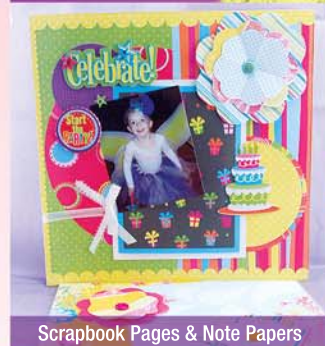
Scrapbook Pages & Note Papers